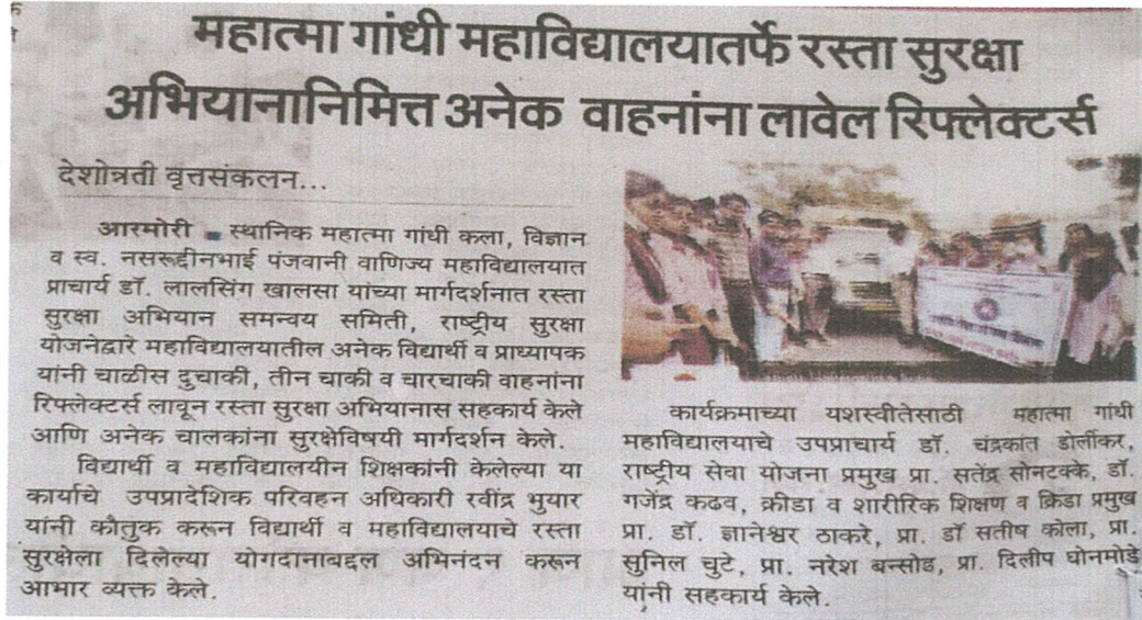
News published in Daily Newspaper Deshonnati